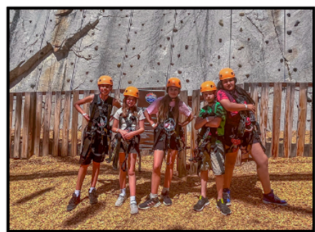
Downieville Middle Schoolers build confidence & community at ropes course