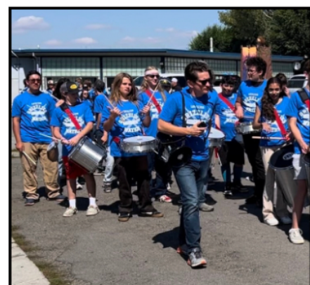
Loyalton High Drum Corps hit the streets