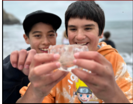
Downieville students find treasures from the ocean on their Headlands trip