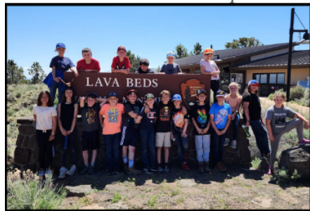
Loyalton Elementary students exploring lava tubes in Lassen County