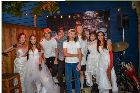
Downieville Rock Bands: SSF & Sierra County Arts Council Funded