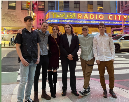
DVL NYC Trip: SSF & Sierra County Arts Council Funded