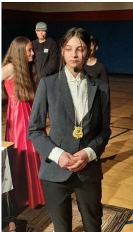
LHS Play & New Mics

Sierra Schools Foundation donors not only invest in the future of hundreds of students, but also invest in the future of Sierra County.